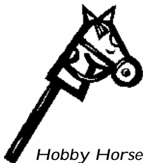
Hobby Horses stabled on track